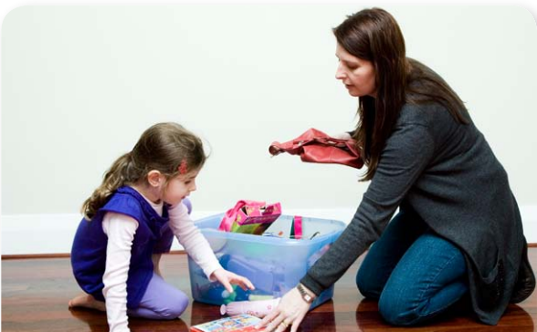
Set a good example e.g. pack away together