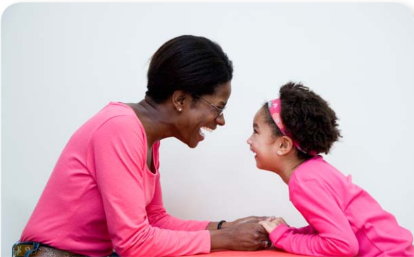
Give positive attention